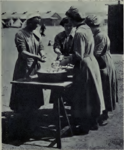
W.A.A.C. Cooks preparing vegetables.